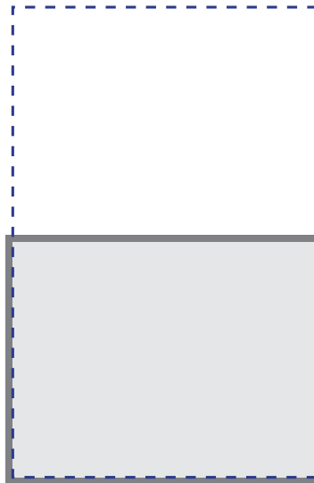
HALF PAGE AD Size 5.5" x 4.25" With bleed 5.75" x 4.5"