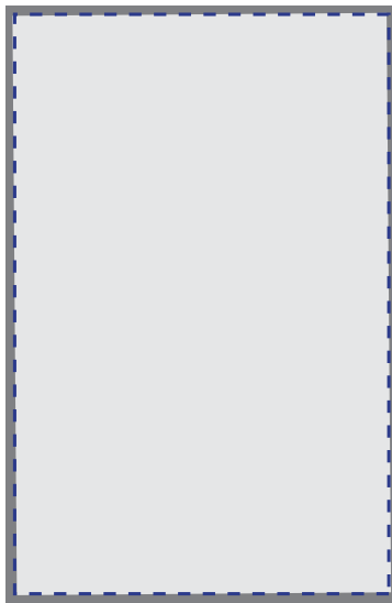
FULL PAGE AD Size 5.5" x 8.5" With bleed 5.75" x 8.75"